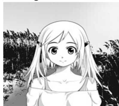
Figure in Manga style.

There's even a club for this! Join followers of the centuries-old Japanese arts of comics, cartoons and animation. Come watch anime from Crunchyroll, eat popcorn and share interest in all things anime and manga, every third Tuesday from 6:15-7:45 p.m. at Main Library. For more information call 892-5296.