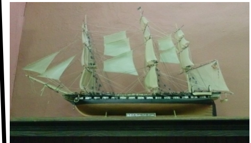
Ship: USS Constitution