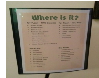
Mirror Lake Directory