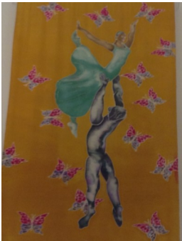
Banner in Adult Computer Lab