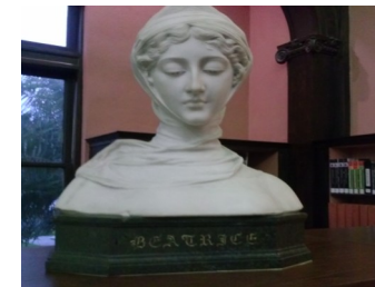
St. Beatrice Bust