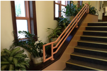
Plants near Adult Fiction