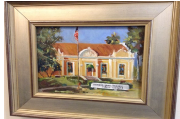
Mirror Lake Painting: 100 years